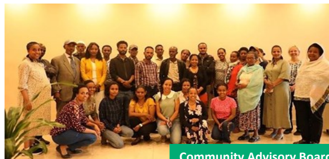
Community Advisory Board

SPARK promotes community involvement through two Local Community Advisory Boards with 46 members and a National Project Advisory Committee of 25 stakeholders. These bodies ensure alignment with policies and community-driven solutions. Awareness campaigns have included consultations with 37 stakeholders to develop detection tools and sensitization meetings reaching 326 community members.