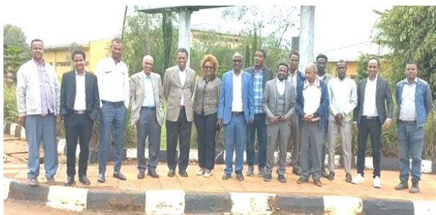
Some participants, launch event, Bonga University

In May 2024, a meeting at CDT-Africa, Addis Ababa University, proposed the establishment of the Network of Excellence for Utilizing Indigenous Medicinal Knowledge Systems (NExUS). This initiative, launched in collaboration with Bonga University, Debrebirhan University, and Arba Minch University, aims to enhance drug development from natural resources by leveraging Indigenous knowledge.